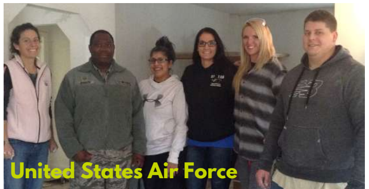
United States Air Force