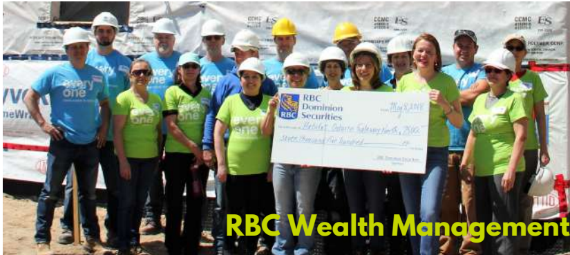
RBC Wealth Management